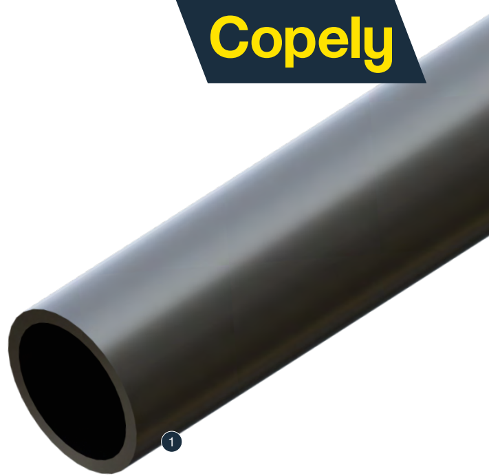
1. Made from PP, LDPE or HDPE