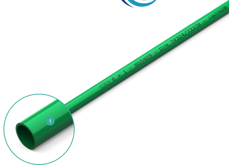
1. Impact modified PA12

Natural, black, other colours available on request